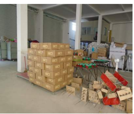
Chapter 6. R&D ability