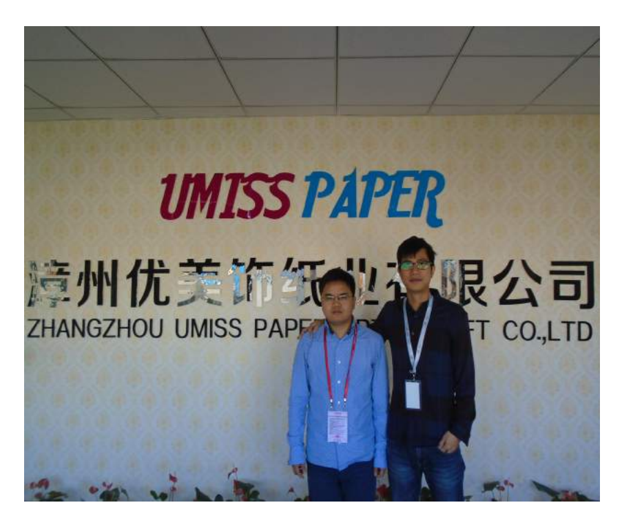
Chapter 2: Basic Information of Umiss Paper