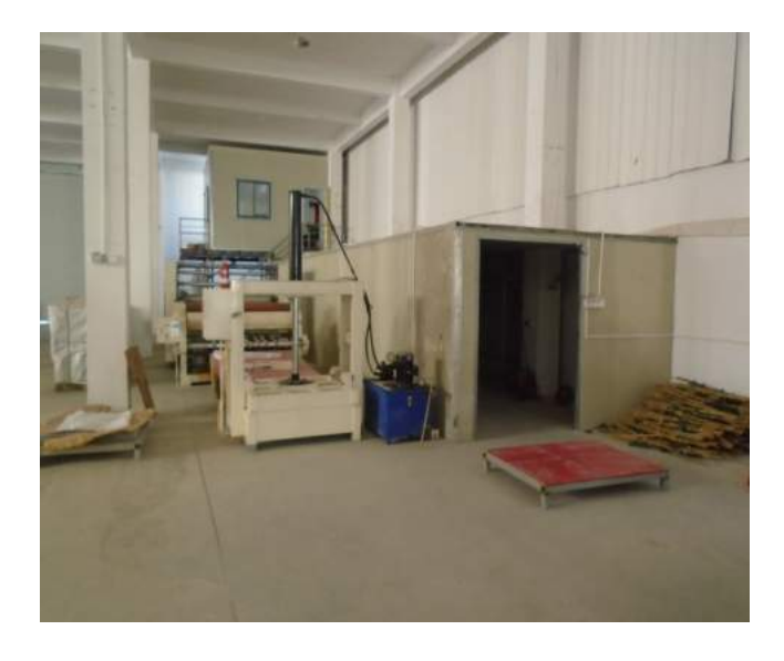
Chapter 7. Order-taking&delivery ability Order-taking ability

Master workers of sample making: 2 Quantity of sample making equipment: 2