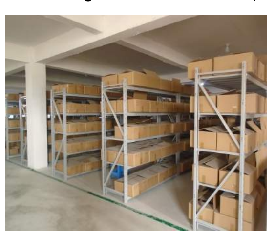
Chapter 11. Company Qualification

Storage Condition: Separated warehouse, placed in order with clear stickers